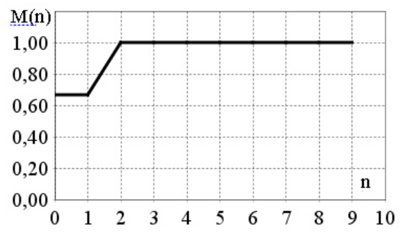
Fig. 2. The dependence of the value of the functional M(n) (46) on the number n of the Legendre polynomials P_n(t) in the solution x(t) (47) for the case S_0 = 1

Figure 2 shows the behavior of the functional value of M (47) depending on the number of polynomials in the solution x(t) (48) for S_0 = 1 . It can be seen that when k > 2 no functional change its value remains constant. This result is due to the finite number of polynomials P_n(t) in the expansion of c(t) (40).