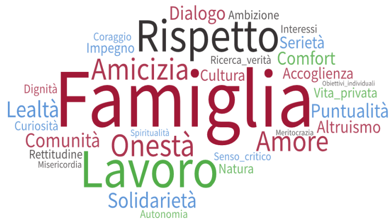
Figure 2. Value references (in Italian) in the qualitative interviews (methodology: content analysis) Рисунок 2. Ценностные ссылки (на итальянском языке) в качественных интервью (методология: контент-анализ)

nature and private life, courage and interests, the search for truth and critical thinking. This is a broad range of values that underpin life's most important actions and the choices we make.